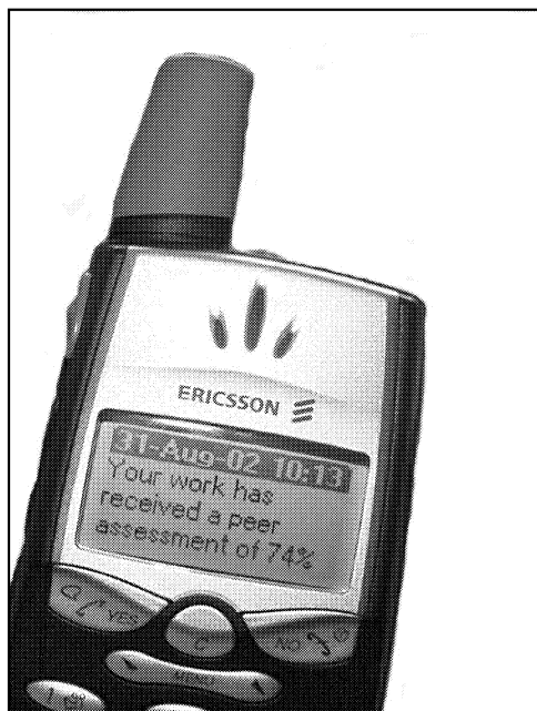
Figure 2. A novel feature of the software is the ability to have a text message sent to the student with a summary of each peer and tutor assessment.

When students start the exercise they enter their email address which provides a unique key for the program and the route for getting peer assessment results to the students. If a student attempts a second submission, they receive an error message informing them that their email address has already been used. To avoid use of the “Back” button, pages of the program are presented in a popup browser window with no menu and with right-click disabled. Students can thus move sequentially through the exercise as they should. If instructors wish, the students can be offered the facility to enter their mobile phone number (UK only at present) which will automatically receive a text communicating a summary of each peer and tutor mark awarded to the student (Figure 2). The email that is automatically sent to the student author following each peer or tutor assessment of their text contains a detailed description of how marks were awarded (according to the marking criteria provided) and also includes an open text response allowing assessors to provide justification and advice.